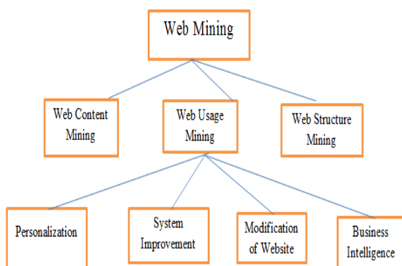
Figure 1.1 Web Mining Categories

There are the three subpart of the data mining. 1) Web structure mining 2) Web content mining 3) web usage mining. Web usage mining is the third category in web mining. This type of web mining allows for the collection of Web access information for Web pages. This usage data provides the paths leading to accessed Web pages. This information is often gathered automatically into access logs via the Web server. CGI scripts offer other useful information such as referrer logs, user subscription information and survey logs. This category is important to the overall use of data mining for companies and their internet/ intranet based application and information access.